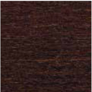
B105 dark wenge