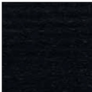
B276 white powder